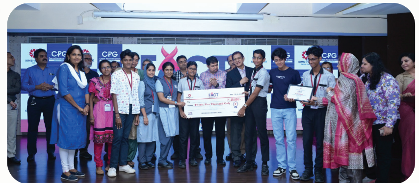
FACT 2023-24 Overall 3rd, Abdul Salam Rafi Residential School Receiving 25,000 cash prize