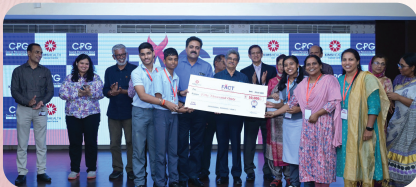
FACT 2023-24 Overall 2nd, Chinmaya Vidyalaya Kattakada School Receiving 50,000 cash prize